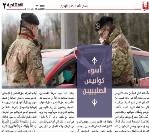
Figure 1. The ISIS newsletter al-Naba titled "The Crusaders' Worst Nightmare". [12-13]

Africa forcefully along with allies to exploit. [14]